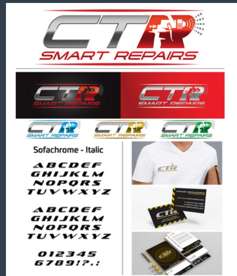
Some of the logo design work examples