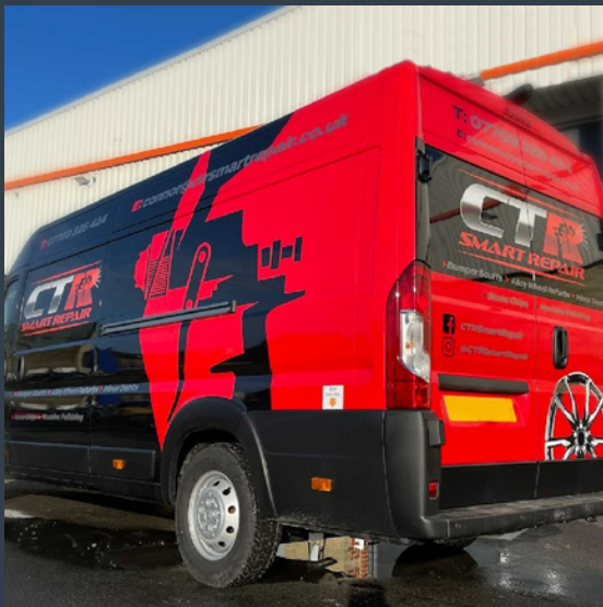
The completed van livery